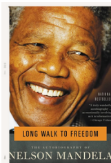
Long Walk to Freedom by Nelson Mandela