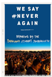
We Say #NeverAgain by Parkland Student Journalists