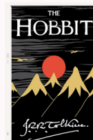
The Hobbit by J.R.R. Tolkien