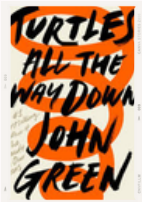
Turtles All the Way Down by John Green

Students entering Advanced English I are required to read ONE of the books below in preparation for the course. Each image below represents a narrative focusing on a character whose experiences lead to maturity and/ or understanding the world in a new way. Not every book is right for every student, so please click on each image to read a description and find the book that is best suited to your tastes, interests, and values. Feel free to do further research on the book to confirm your choice is the best one for you.