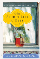
The Secret Life of Bees by Sue Monk Kidd