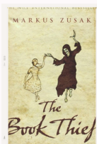
The Book Thief by Markus Zusak