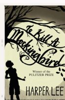
To Kill a Mockingbird by Harper Lee