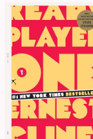
Ready Player One by Ernest Cline