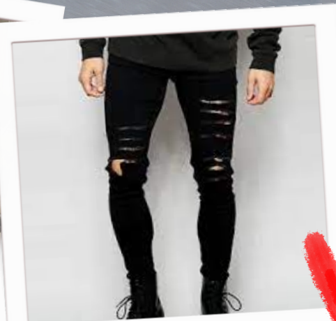
Rips / Tears