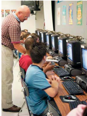
NISD: A National Technology Leadership Salute District

"Northside ISD consistently and effectively uses technology tools to