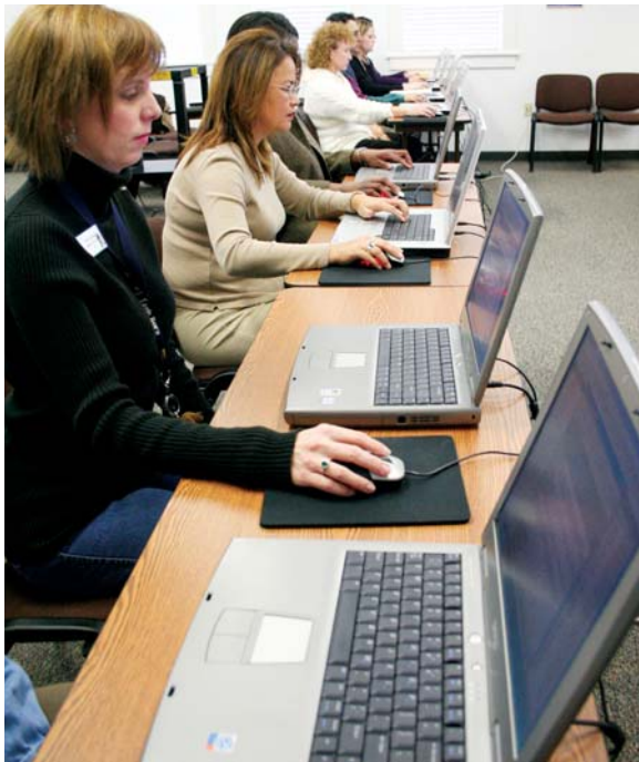
Laptops for teachers & personal student laptops allowed: Teachers at Brandeis HS, Vale MS, and Forester ES will receive wireless laptops instead of desktop machines.